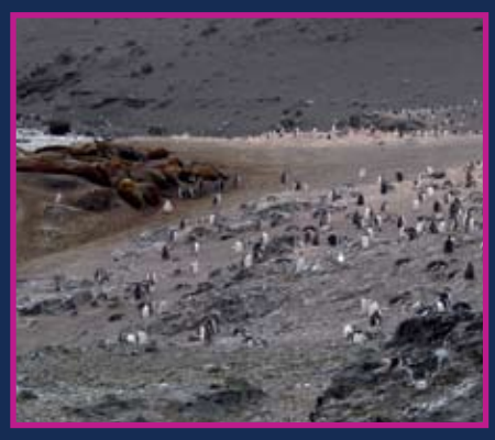
Caution - restricted visitor space and dense