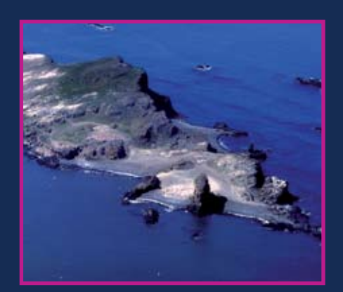
Hannah Point from above

The primary landing beach may be crowded with wildlife – under such circumstances it would be not possible to make a landing and maintain the required precautionary distances. Both landing beaches are prone to swells. Be careful near the jasper dyke. It is brittle and may crumble. Exercise particular caution not to disturb animals near cliff edges. If they are disturbed, they may retreat and fall.